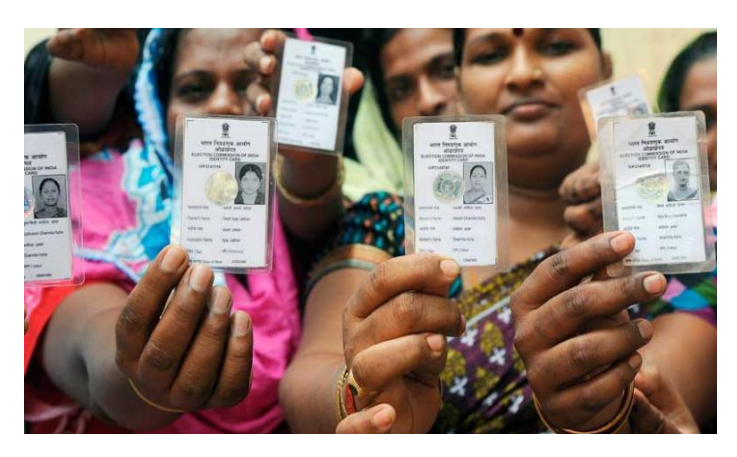
"I would have been transgender no matter what body I'd been born with. Tell the doctors that we exist for the health of humanity, which needs to find wholeness and belief in complexity."