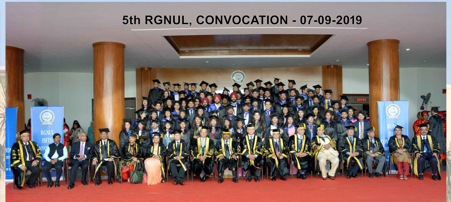
5th RGNUL, CONVOCATION - 07-09-2019

Duisenberg School of Finance, Amsterdam Graduate Institute, Geneva Osgoode Hall Law School, York University University of Chicago World Trade Institute, University of Bern University of Exeter University of Washington Tilburg University Albercht Mendelssohn Bartholdy Graduate School of Law, University of Hamburg