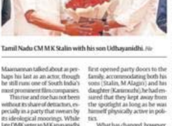
Tamil Nadu CM MK Stalin with his son Udhayanidhi.