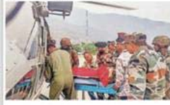
The injured soldiers being airlifted to Udampur-based command hospital on Thursday.