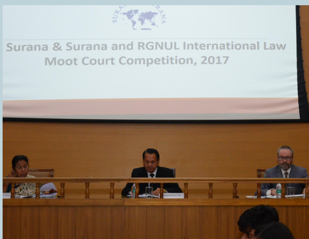
1st Surana & Surana and RGNUL Moot Court Competition, 2017