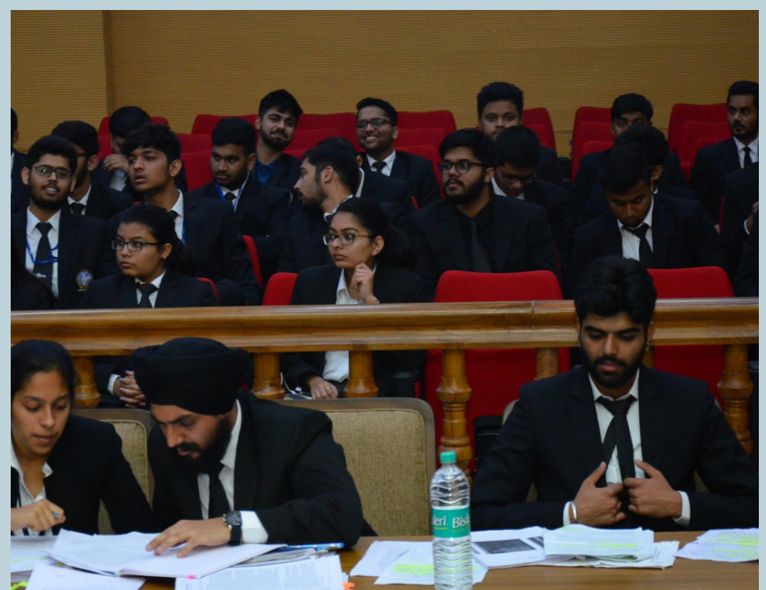
Stetson International Environmental Law Moot Court Competition, 2016 (India Rounds)