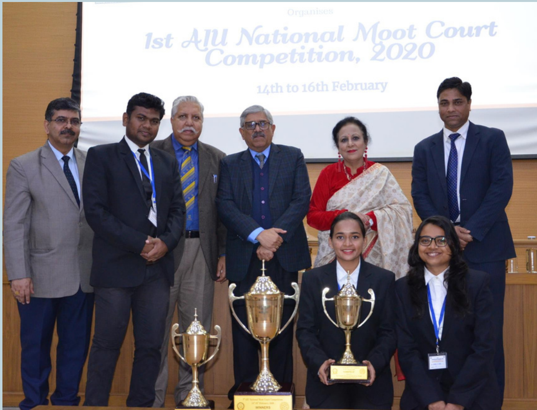
1st AIU National Moot Court Competition, 2020