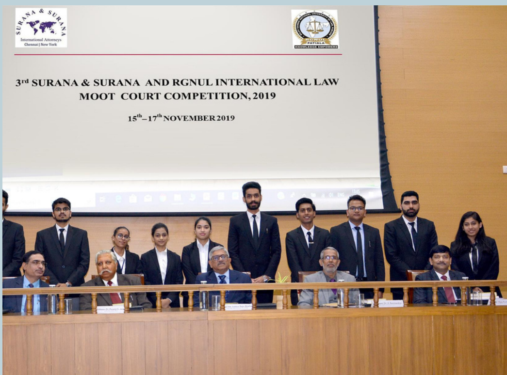
3rd Surana & Surana and RGNUL Moot Court Competition, 2019