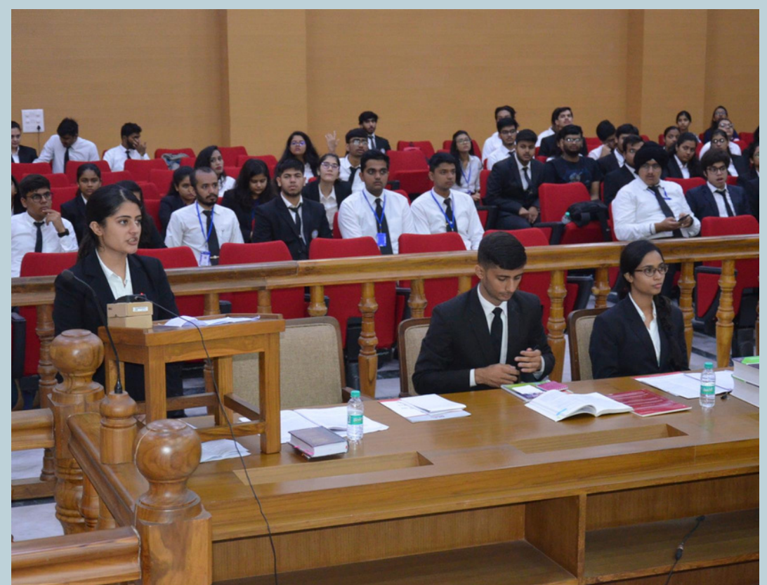
7th RGNUL National Moot Court Competition, 2018