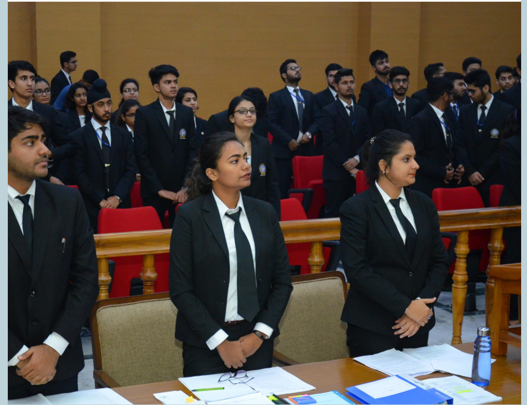
8th RGNUL National Moot Court Competition, 2019